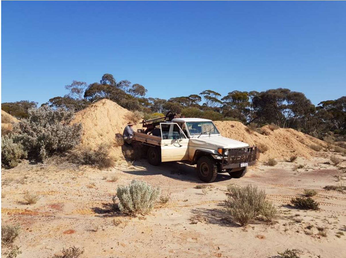
Photo 1. Sampling at Bonnie Vale Project

During the sampling process, the coordinates of each dump are recorded along with an estimation of its volume. Notes are taken as to the colour, rock type and other physical characteristics of each dump. Generally, isolated small dumps are ignored for the sampling purposes.