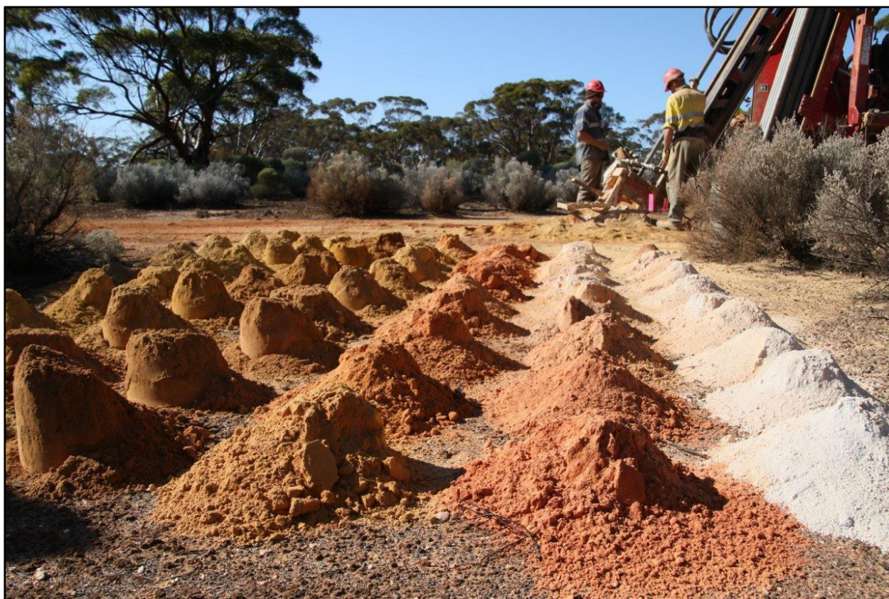
Figure 3: RAB Drilling at the Zuleika JV.

The overall strike length of the two interpreted black shale targets is 5km, and geological logging of the drill holes completed at these targets has identified the prospective black shale across several of the drill lines in these targets.