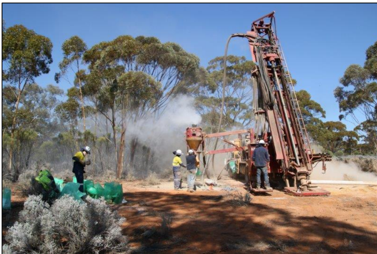
Figure 2: RC Drill Rig at the Zuleika JV.

RAB drilling also commenced on four of the initial five targets, with drilling commencing on the sheared felsic target approximately 1km east of the Bullant deposit. This program will comprise approximately 15,000m of RAB drilling. Phase 1 is designed to test approximately 5km of the interpreted Zuleika Shear and associated structures. Limited wide spaced historic drilling in this target had yielded encouraging results.