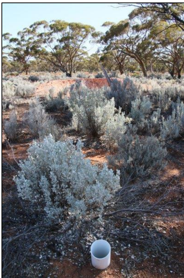
Figure 4: Previously Unknown Historic Workings and RC Drill Hole.